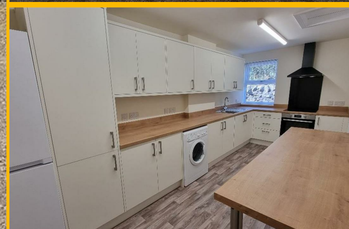
2 Halhill Farm Cottage, Collessie, Cupar, KY15 7RH £850 PCM