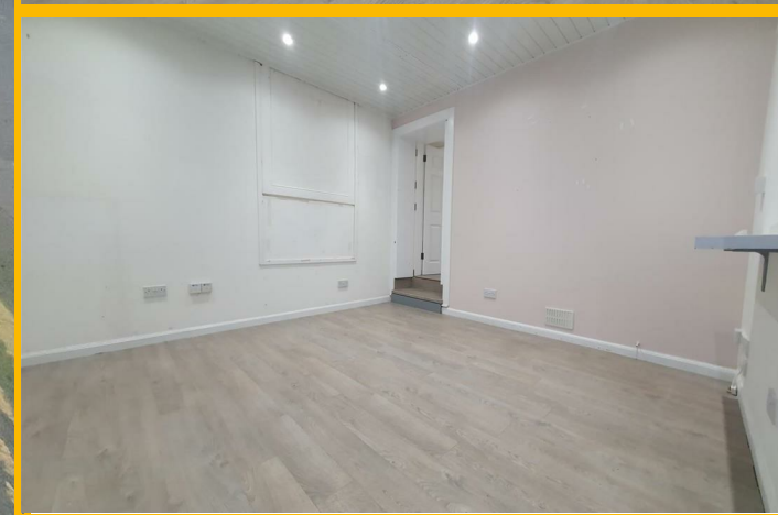
Caledonian House, Links Road, Leven, KY8 4HS £450 PCM