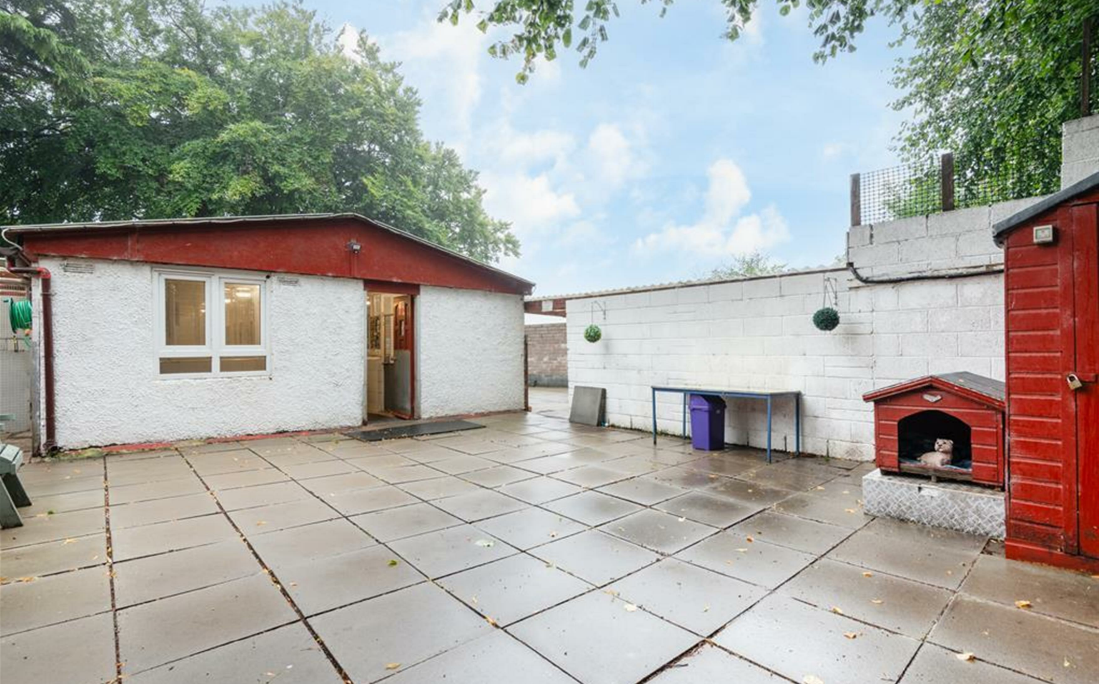
Second Chance Dog Kennels Balbeggie Avenue, Thornton, Kirkcaldy, KY1 3NS Offers Over £100,000