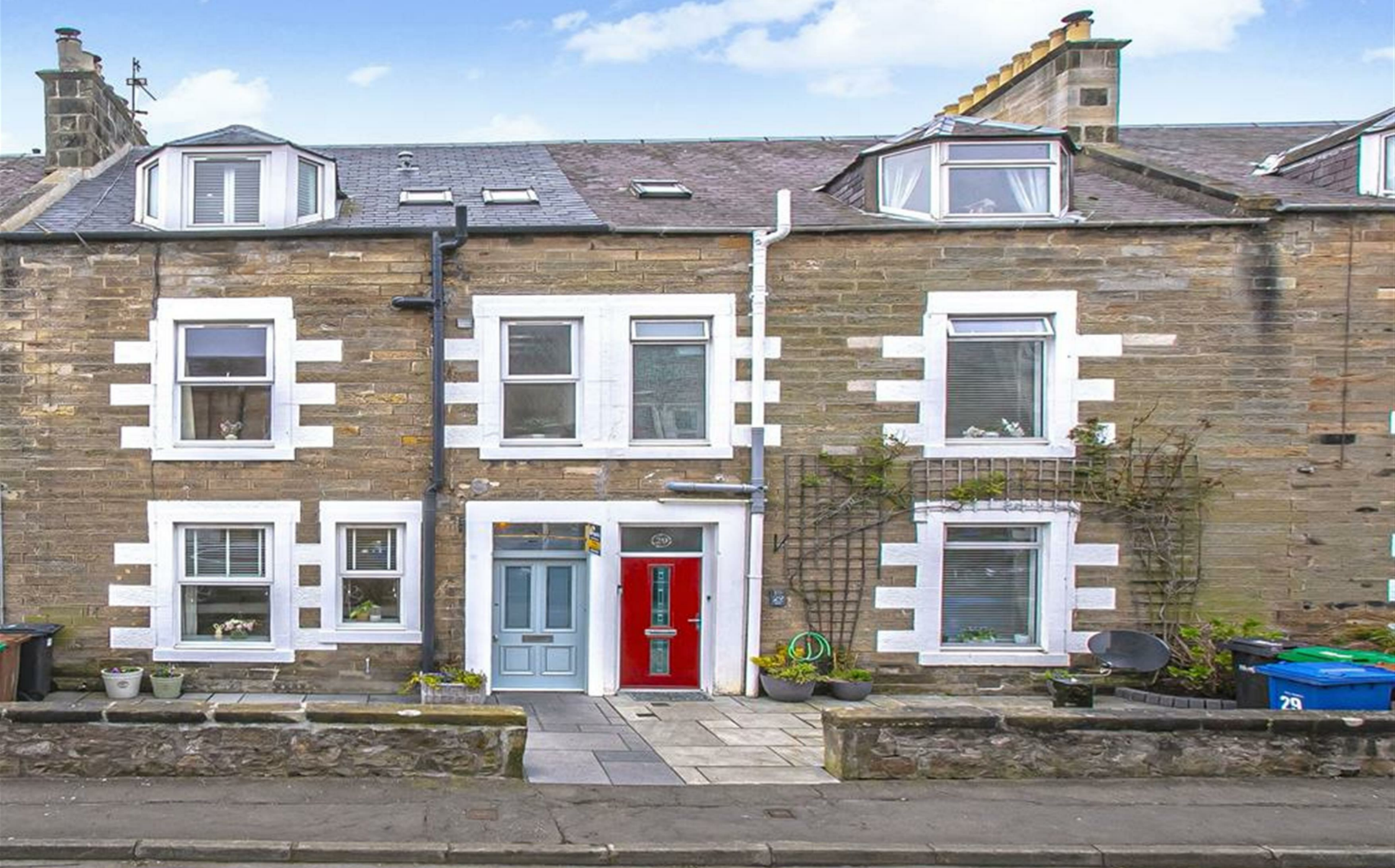
27 Rodger Street, Cellardyke, Anstruther, Fife, KY10 3HU Offers Over £475,000