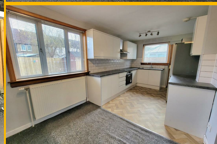
16 Linnwood Gardens, Leven, Fife, KY8 5AJ £750 PCM