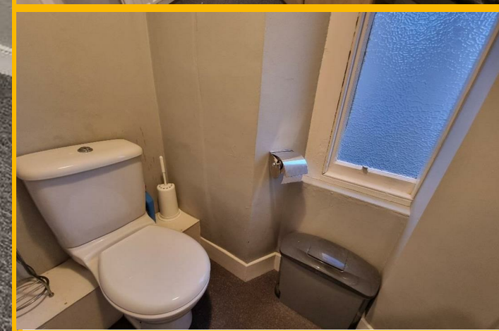
Room 1, 12 St. Catherine Street, Cupar, KY15 4HH £200 PCM