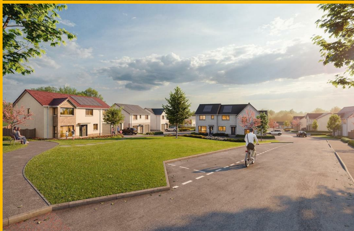
TAMARISK, THE TEMPLE BALCURVIE Windygates, Leven, FIFE, KY8 5FW Fixed Asking Price £334,995