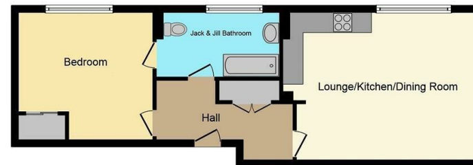
Ground Floor - Apartment 1 - Approx 57 sqm